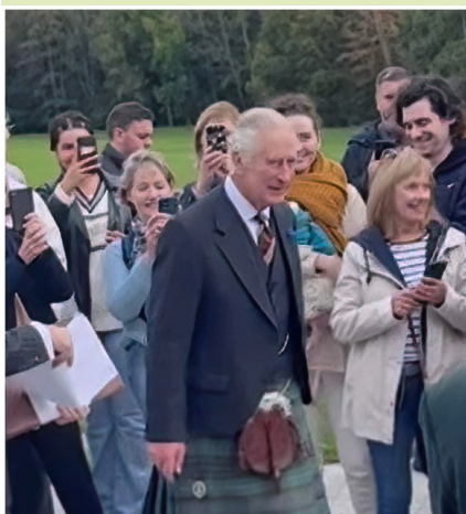
HM King Charles III Re-Opening of The Burrell Collection 13th October 2022

While the Cycleway itself is still under construction, the pedestrian crossing into the Park at St Andrew's Drive is a great improvement from the previous crossing.